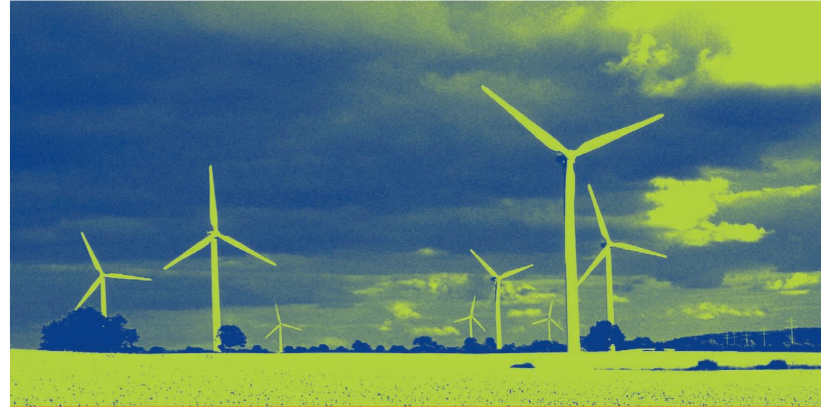
Chain hoists with 110 m height of lift for wind power stations REpower, Husum

STAHL CraneSystems _ Crane technology made to measure >>>